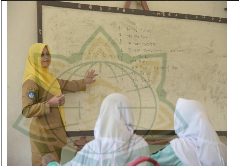
Figure 4.10 “Don't let your learning lead to knowledge. let your learning lead to action”.

activities. The extracurriculars have been improved. So, there are rules, for example, every school must develop extracurriculars related to improving language skills. Can speak international languages, regional languages and Indonesian too. So that we, especially PBI teacher candidates, don't feel worried and afraid of their future prospects.