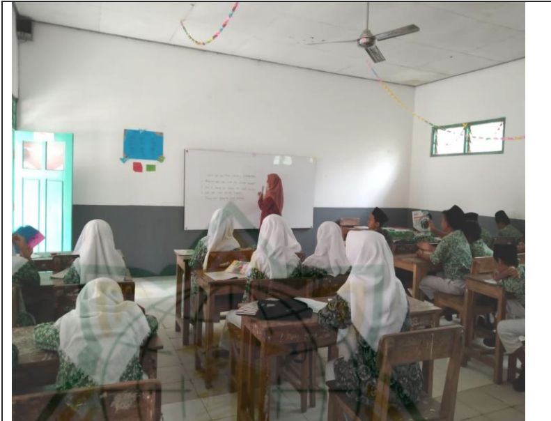
Figure 4.8 “The good teachers are those who show you where to look but don't tell you what to see”.