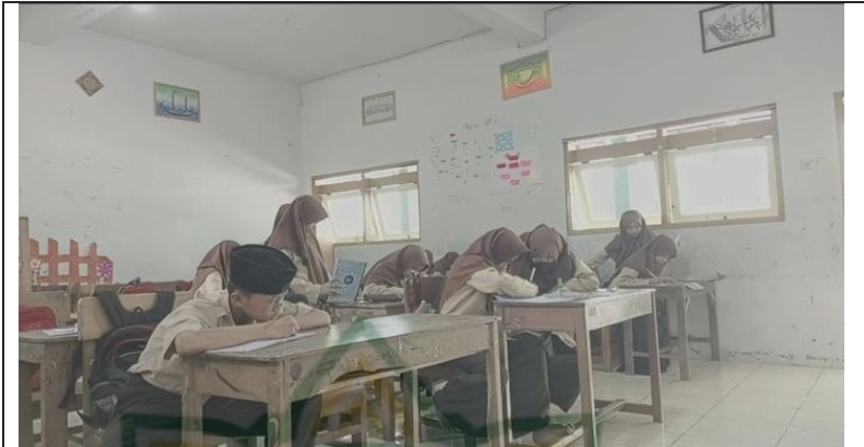
Figure 4.1. “Students who have no interest in English will understand even less if this subject is removed”.