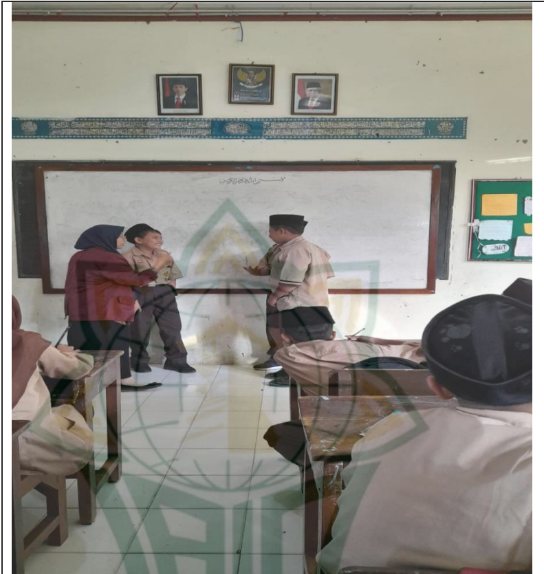
Figure 4.2. “Students must be taught how to think, not what to think”.