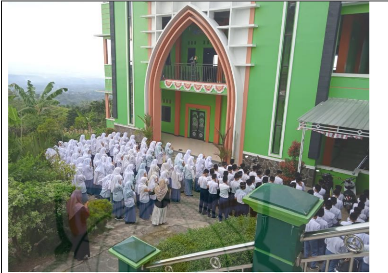
Figure 4.6 “Students don't remember what you tried to teach them, they remember who you are”.