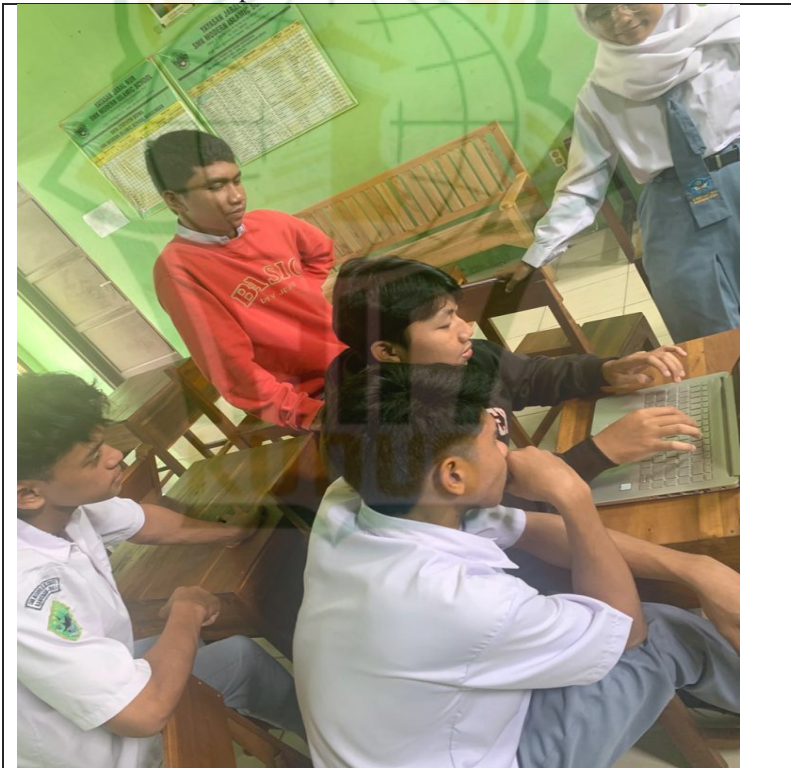
Figure 4.8 “Self-taught generation, who are educated By the internet and utilized by technology, it will eventually make the industrial education system develop”.

If in the future the English subject is completely removed, perhaps English language education students will lose many job opportunities. However, there are still a number of plans or opportunities that can be carried out for prospective English teachers if this subject is completely abolished in schools, one of which is by opening independent English courses or joining English courses that have been established and spread all over the world. Indonesia.