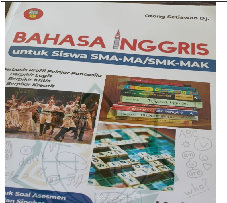
Figure 4.4. “Learning is a treasure that will follow its owner everywhere”.