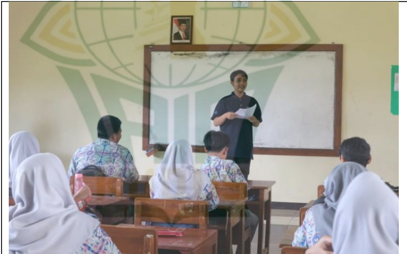
Figure 4.3. “Education would be much more effective if the aim was to ensure that by the time they leave school every boy and girl should know how much that they do not know, and are imbued with a lifelong desire to know it”.

Maybe the opportunity and the plan is to make a course or some kind of tutoring for all levels. Or maybe English can be made as a compulsory extracurricular at school.