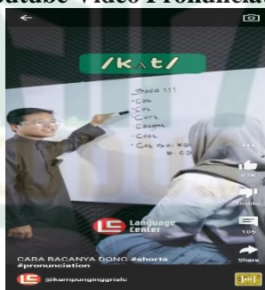
Figure 4.2 Kampung Inggris LC Youtube Video Pronunciation