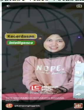
Figure 4.1 Kampung Inggris LC Youtube Video Vocabulary

From the results above, many of the participants can increase their vocabulary by using the "Kampung Inggris LC - Language Center" YouTube channel, because the content in the YouTube channel discusses a lot about vocabulary.