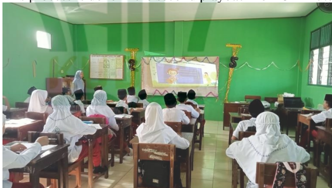
Figure 4. 2 The Use of English Singing Learning Video