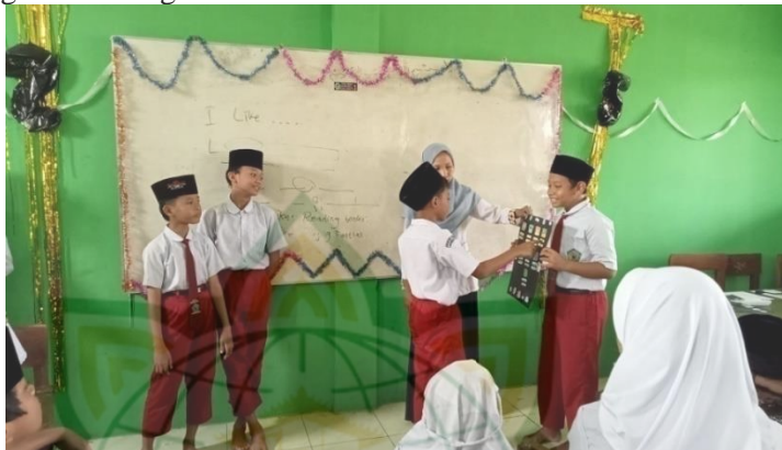
Figure 4. 4 Evaluation Stage

understanding of the material explained 18 Thus, presentation activities help students increase their activeness and help teachers directly assess students' understanding during the English learning.