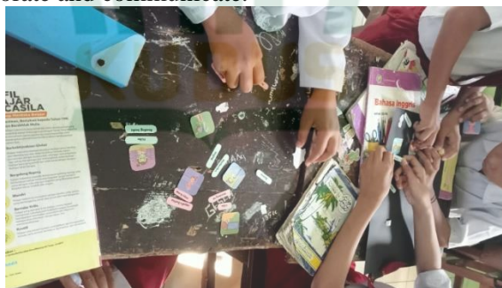
Figure 4. 3 The Use of Scrapbook

Teacher AFD said this activity was conducted by adjusting to the characteristics of active students who like pasting pictures. In addition, this activity aims to help students recall vocabulary and create more interactive learning by involving cooperation between students because it is done in groups in a discussion. 16 Thus, the Scrapbook not only acts as a medium to train vocabulary recall but also hones the ability to collaborate and communicate.