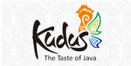
Logo Kudus.jpg 68K