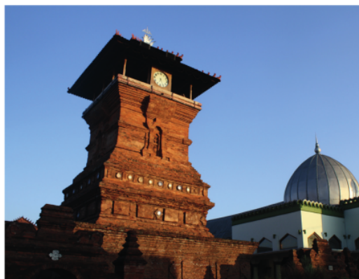
Figure 3: Menara Kudus, the Identity of the Kudus Regency

Hok Tik Bio Temple. Hok Tik Bio Temple is located in Tanjung Karang Village, Jati District, Kudus Regency. The Tri Dharma Amurva Bhumi Foundation which manages. The temple was built in the XIV century AD. The buildings, made of stone, red brick, cement, and wood are still used as places of worship.