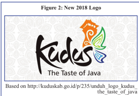
Figure 2: New 2018 Logo

Traditional institutions: These can be a tourist attractions where visitors to enjoy or explore things that are unique or which provide information. An