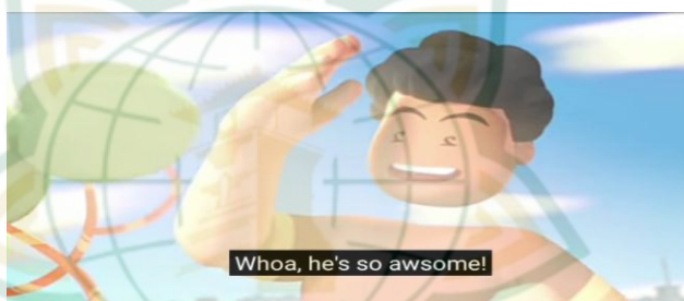
Figure 4. 3 Expression of Figurative Language Episode 1 4

The story in the first episode told where Best Muslim took the garbage that is thrown carelessly by Gen Bowl to be thrown in the trash so that Gen Bowl is amazed by Best Muslim’s action.