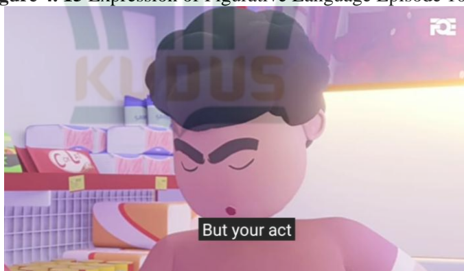
Figure 4. 15 Expression of Figurative Language Episode 10 16

Gen Bowl : “Get rid of your bid'ah feet from my sight!” (While kicking the Best Muslim's feet)