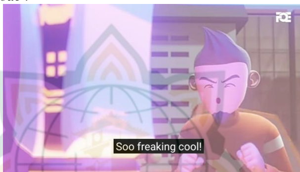
Figure 4. 8 Expression of Figurative Language Episode 7 9

Based on the dialogues above, the sentences which is a figurative language was a sentence in bold by the researcher. The first phrase in bold is “ soo freaking cool ” said by Best Muslim, this phrase classified as a hyperbole because the word used to emphasize how cool the PS 5 is, meanwhile, the word “cool” express that the PS 5 is awesome but in the movie the character has said cool and added other words like “soo, and freaking” to strengthen his utterance by exaggerating word.