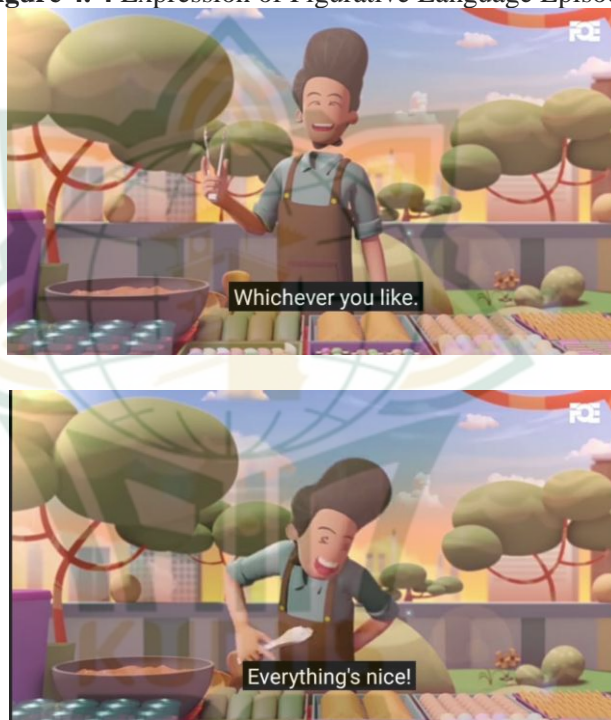
Figure 4. 4 Expression of Figurative Language Episode 2 5

Furthermore, Best Muslim bought lots of iftar food, and when he got home, Best Muslim prepared iftar while waiting for the maghrib azan, and finally the maghrib azan sounded then Best Muslim immediately ate a lot until he was full and could not do the maghrib prayer. After that, the story ended and the story scene is repeated because in the first story excessive behaviour in terms of food is not in accordance with Islamic teachings and a Muslim should not do it because it is not the character of a good Muslim.