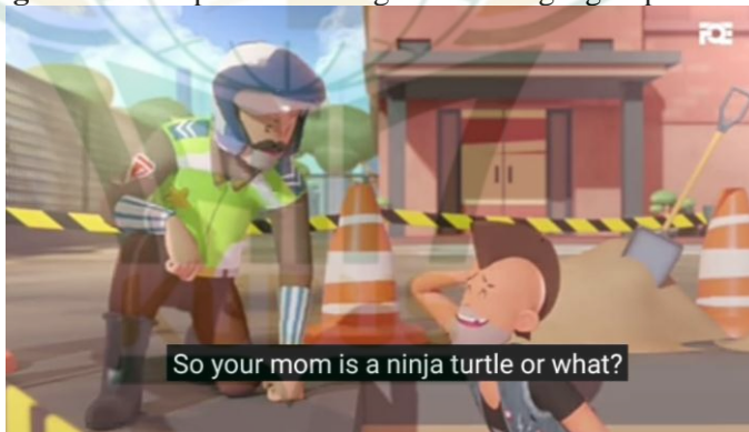
Figure 4. 13 Expression of Figurative Language Episode 9 14

And the scene was repeated with the story Tubagus Pungky woke up on time and rode a motorbike wearing a helmet, and rode his motorbike at standard speed and during the trip Tubagus said Allahu Akbar and be patient when in traffic jams and at the end of the story Tubagus invited others to remember Allah for peace of mind when things are chaotic by saying: