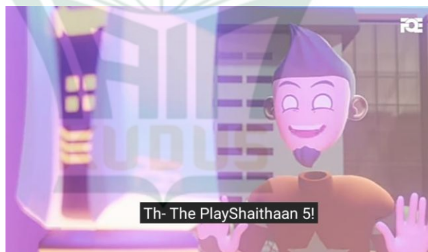
Figure 4. 7 Expression of Figurative Language Episode 7 8

Then, the second sentence in bold is “ Wooo, that’s the latest gaming console in the market! The PlayShaithaan 5! ” categorized as an irony in which it implies utilizing words are utilized in such a way that their expecting meaning is distinctive the real meaning of the words. Best Muslim used the word “the PlayShaithaan”