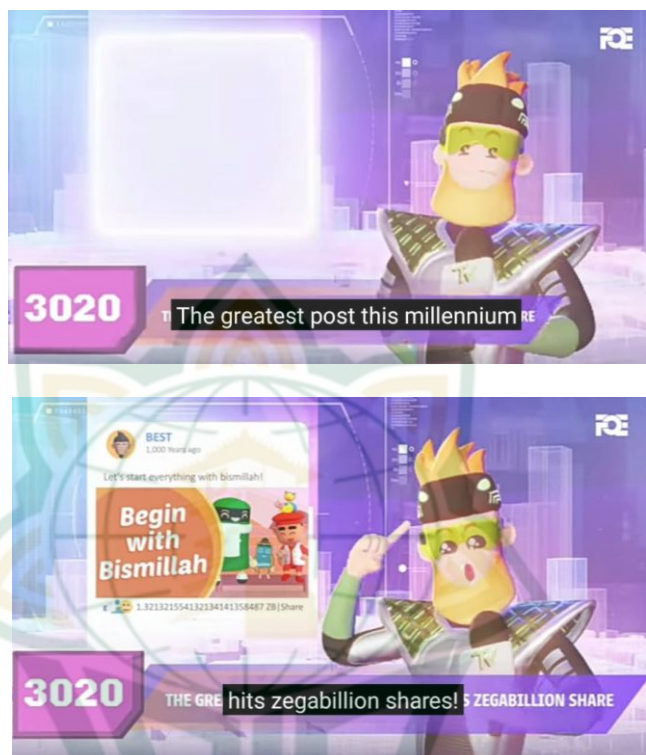
Figure 4. 12 Expression of Figurative Language Episode 8 13

In the bold sentence spoken by the news anchor, the researcher categorized it in the type of figurative language that is hyperbole because it expressed by exaggerating words where the post was liked and shared not only up to megabillion but even up to zegabillion shares. Meanwhile, in real life it is difficult to obtain likes and shares up to zegabillion and in this story used hyperbole to make the story more interesting.