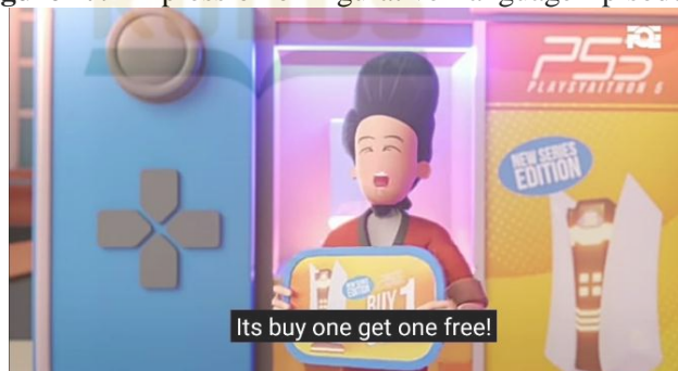
Figure 4. 9 Expression of Figurative Language Episode 7 10

Based on the dialogues above, the sentences which is a figurative language was a sentence in bold by the researcher. The first phrase in bold is “ soo freaking cool ” said by Best Muslim, this phrase classified as a hyperbole because the word used to emphasize how cool the PS 5 is, meanwhile, the word “cool” express that the PS 5 is awesome but in the movie the character has said cool and added other words like “soo, and freaking” to strengthen his utterance by exaggerating word.