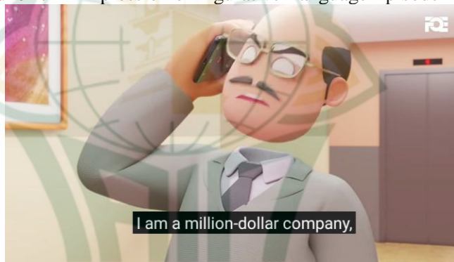
Figure 4. 17 Expression of Figurative Language Episode 12 18

Besides that, Bossman does not respect his employee that is Gen Bowl, Bossman always scolds even though the employee has done nothing wrong and Bossman also orders Gen Bowl to do a lot of office work thus he cannot take a break if his work is not finished: