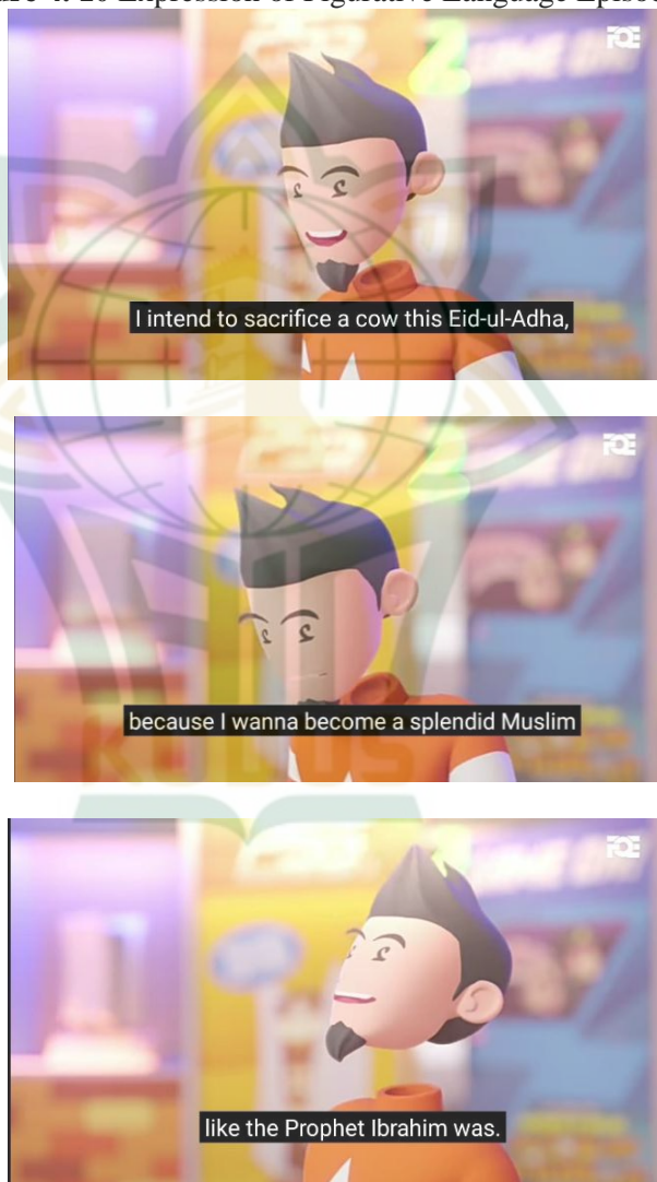
Figure 4. 10 Expression of Figurative Language Episode 7 11

The next phrase in bold is “ it’s buy one get one free! ”, and this sentence was grouped as a repetition sentence where this sentence used the repetition of the word “one”, the repetition of the word in this sentence is used to highlight and clarify the meaning that by buying one item we get one more item for free, hence, by using repetition word make it easily remembered for audiences.