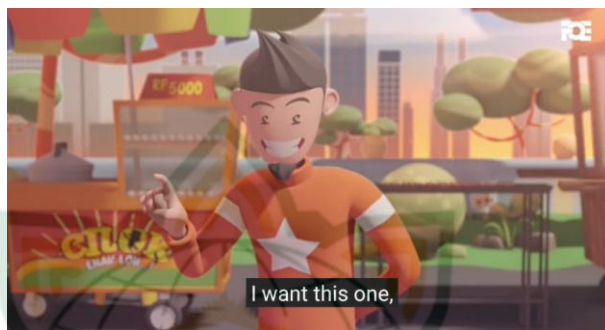
Figure 4. 5 Expression of Figurative Language Episode 2 6

Then, the sentence that in picture classified the synecdoche is “whichever you like, everything’s nice!” , it a whole stand for a part in which every food sold by the seller tastes good.