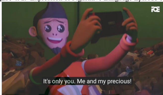
Figure 4. 19 Expression of Figurative Language Episode 14 20