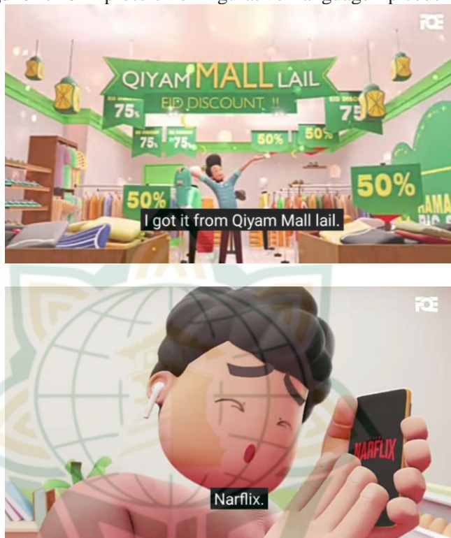
Figure 4. 18 Expression of Figurative Language Episode13 19

During Ramadan, we visit the Mosque every day and pray qiyamullail every night, we want to continue the routines after Ramadan, even it is only two extra rakaah at night. We fast for the entire month, and we want to continue fasting throughout the year, although it is only for a couple of days. Then most definitely, as Ramadan is the month of the Quran, we read it extensively night and day, when Ramadan ends, we still maintain the intimate relationship between the Holy Quran and us. Our deeds should not cease with the closing of Ramadan, instead, we must continue and keep getting stronger because this is the sign of ultimate success. All of this teaches us to be the Best Muslim.