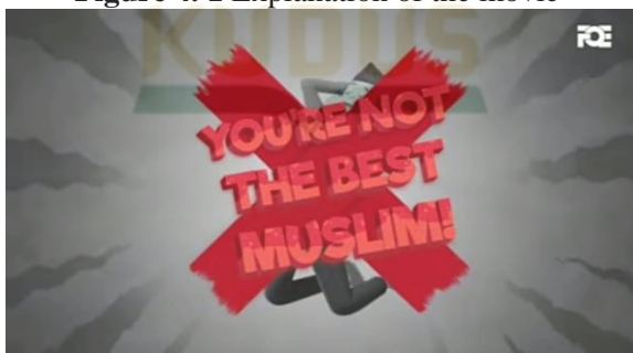
Figure 4. 1 Explanation of the movie 2

Furthermore, among the characters in this movie are Best Muslim, Gen Bowl, Tubagus Pungky, Mr. Termity, Bosman, Hairman and so on. Each story from the episode of I'm the Best Muslim Movie season 1 told 2 storylines, namely the first storyline talks about the behaviour of Muslim who is not good in behaviour that is not accordance with Islamic values, for instance, not maintaining cleanliness, after that the narrator said that You're Not the Best Muslim like this picture below: