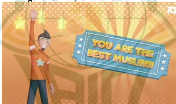
Figure 4. 2 Explanation of the Movie 3

After displaying the research method within the Chapter III, the researcher goes on the following part of the inquire about. In this chapter, the researcher has discovered the research findings that were the figurative languages are found in I'm the Best Muslim movie and analysed it into the types of figurative language using the theory of figurative language by Richard E. Mezo and Gorys Keraf. Moreover, the researcher found the most widely of figurative languages are used in I'm the Best Muslim movie. In this part, the researcher discussed the discoveries in depth to answer the research problems.