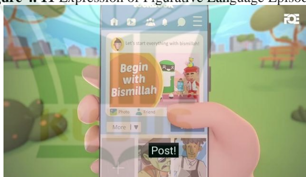
Figure 4. 11 Expression of Figurative Language Episode 8 12

After that the storyline showed that 1000 years later the Best Muslim post went viral and was reported because the post got likes and was shared until it reached zegaBILLION share, and the news monologue as follows: