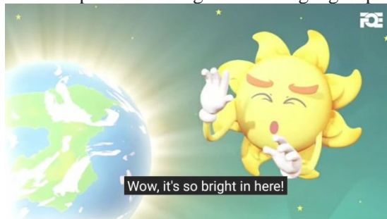
Figure 4. 6 Expression of Figurative Language Episode 6 7

After that, at the end of the story there is a hadith about a matter which if done will love between others and the matter is to spread the Salam among each other. Thus, the world will be peaceful if people spread kindness.