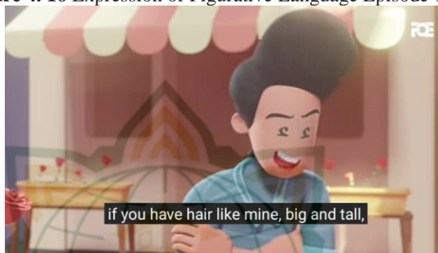
Figure 4. 16 Expression of Figurative Language Episode 11 17

After the conversation, Bossman came in a luxury car and expensive clothe, then he got out of the car while scattering his money near Tubagus and Hairman until Bossman felt he was the best from Tubagus and Hairman.