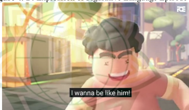
Figure 4. 14 Expression of Figurative Language Episode 9 15

In this ninth episode, the researcher found the use of figurative language, there were 2 types of figurative language used in ninth episode, they were metaphor and simile and the sentences were in bold by the researcher. The first sentence is ” So your mom is a ninja turtle or what? ” said by Mr. Termity, further this sentence is included in the figurative language type of metaphor because it states 2 different objects directly symbolically, where Mr. Termity said that Tubagus’ mother is a ninja turtle, and this does not mean that she is a ninja turtle literally, but because Tubagus rides a motorbike at high speed and is agile to pick up his mother, and Mr. Termity assumed that Tubagus’ mom is a ninja turtle. Furthermore, the second sentence is “ I wanna be like him! ” said by Gen Bowl, it is classified as a simile because in the story where Gen Bowl wants to be Tubagus Pungky who has turned into a better Muslim and has a good character, such being more patient and inviting people to