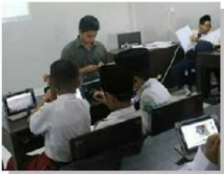
Fig. 1. Ipad preparation (checking) before learning through ipad learning media.

"In Islamic education learning I usually teach with methods that are often used, namely lectures, question and answer, discussions, presentations and so on. From these methods then I combine them with ipad learning media or here commonly called one teacher one tab and one student one tab. But I also adjust to the material I teach, because the use of learning media if it is not adapted to the material will also be in vain. The application of Ipad Learning learning media that I did in class with the following procedure: I set the goal of teaching using learning media, in this step formulating the objectives to be achieved. Then, I prepare the media that will be used, namely ipad learning, before learning I check the material to be taught on the ipad that will be used. Furthermore, students are given directions in advance to be able to use the media to be used namely the ipad. After that the presentation of lessons and demonstrations. There are several forms, some in the form of ebook, in which there are books in the form of files that have been stored on the iPad, there are power point slides, or in the form of videos related to the subject matter. After the preparations are completed, the learning activities are completed. The steps are in accordance with the RPP I made. Then the last step of the lesson evaluation " (Khoiriyah, August, 2017).