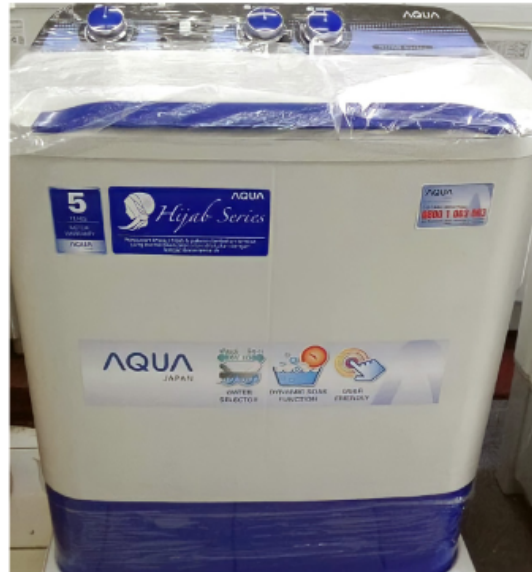
Image 1. The product of the Hijab Series washing machine.

for a hijab tends to be delicate and smooth – usually a type of chiffon or cheesecloth or a diaphanous scarf – and care must be taken in laundering it, let alone putting it in a machine with other dirty clothes. Interestingly, the marketing team have designed posters and organized campaigns distributed through online media which explicitly contain the word “ hijab series ” as part of their appeal (see Image 1). The marketing team has assured consumers that the Hijab Series washing machine will launder hijabs without fear of the fabric being damaged or causing discoloration, underlining that the machine is equipped with a pulsator designed to run at a certain speed to prevent fabric damage during the laundering process. The promotion of this device began in 2018 and it continues to be in demand among Indonesia’s Muslim community.