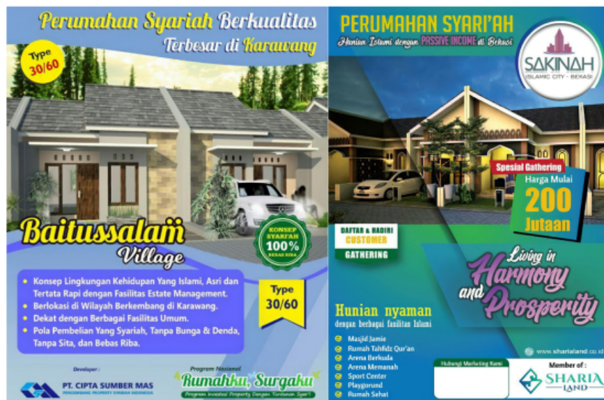
Image 3. Promotional posters.

Arabization and Islamization can also be observed in the lifestyle choices of Indonesian Muslims, particularly in the phenomenon of sharia' housing. Sharia' housing refers to a type of property whose conveyancing system is implemented in accordance with the sharia', particularly in the sense that the ownership scheme is run according to the precepts of Islam. These new Indonesian trends in business and Muslim lifestyles are expressed in a number of Arabic terms, targeting people in search of new alternatives in their choice of housing and/or properties in an environment which approaches Islamic norms as closely as possible (see Image 3).