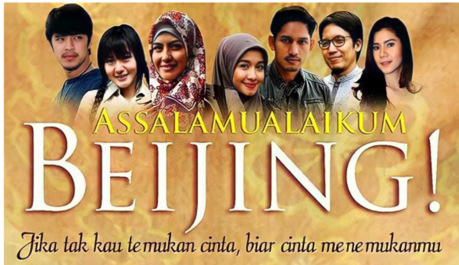
Image 6. Assalamualaikum Beijing .