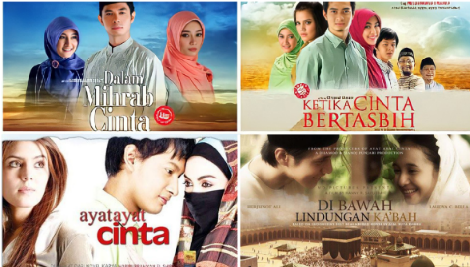
Image 5. Indonesian films containing Arabic words.